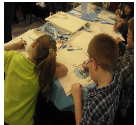
Pictured Above: Youth decorate reusable shopping bags at GYSD Celebration of Service. Bags donated by HandsOn Twin Cities