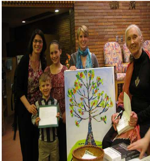
Pictured Above: Supervisor, Students and Promise Fellow pose with Jane Goodall

On April 19 th Dr. Goodall addressed a crowd of over 1,500 people inspiring us with her reasons for hope. In spite of the problems our world faces, she looks to the human brain, the human spirit, the resilience of nature, and the compassion of children as her reasons for hope. Our students demonstrated that hope through this project.